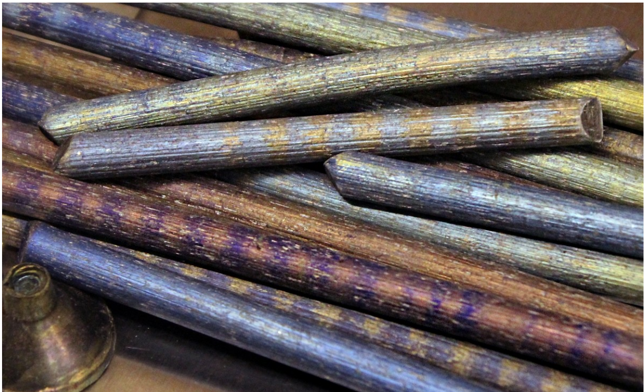
Europium, a rare earth element that has the same relative hardness of lead, is used to create fluorescent light bulbs.

10. Recycling, reuse and more efficient use of critical materials could significantly lower world demand for newly extracted materials. Currently, only 1 percent of critical materials are recycled at the end of a product's life.