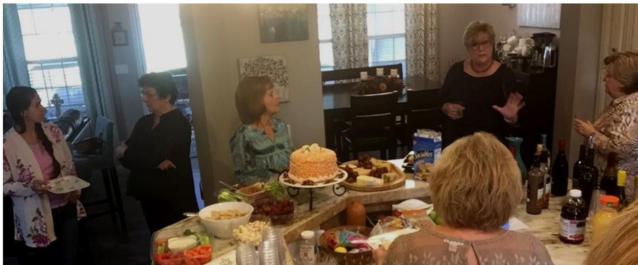
Wine and Cheese Mentorship Social—Lafayette Club Members, November 12, 2017