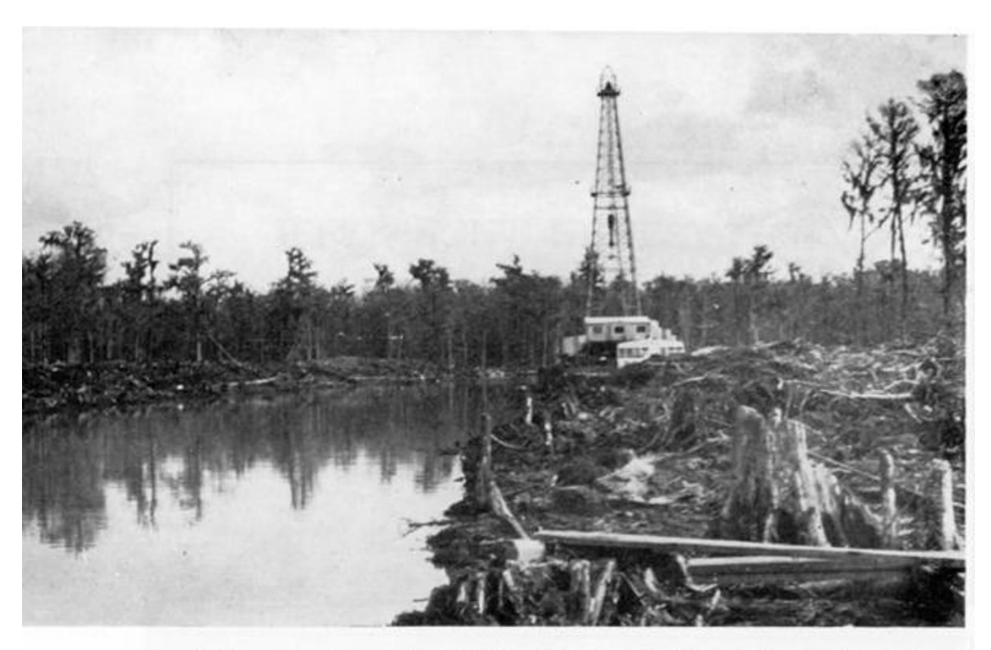
The California Co. drills from barges in the Barataria field. This canal was dug especially to give access to the proposed drill site, as water transport is more feasible than land travel through the marshes. The rig is on a barge, sunk in the canal to give a solid foundation for drilling operations.